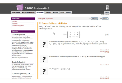
Figure 4: An exercise with clearly marked questions.