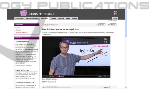
Figure 3: Prepare for the lecture - view the appetizer video!.