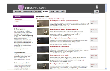
Figure 1: All lectures are available on video.

Originally our working title for the e-Notes was transfer notes . We consider them as an integral – yet compactly distilled – part of the whole enterprise. They function as a constant reference for all the other activities so that there is in principle a link to the relevant section, example, or theorem from every other activity in the course. The idea is thus twofold – to keep the e-Notes as a text and to actively help lifting this text into every corner of the course. Technologically the text is constantly only one click away – through the portal of the course. We have the hope – to be seen and reported – that the students in this way will be able to 'carry' and ' transfer ' what they have learnt much more readily into their next courses in the engineering disciplines.