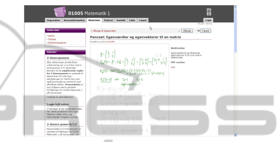
Figure 2: Look and listen to a careful pencast solution.