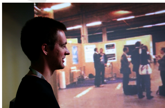
Figure 1: Teaser picture of being immersed within a large real-time virtual office environment.

the generated models and physical scenery.