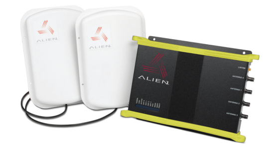
Fig. 1. RFID Antennas and Reader (image courtesy of Alien Technologies).