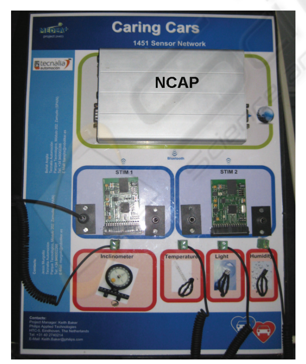
Figure 3: Demonstrator panel.

On the other hand, some limitations, problems and/or disadvantages have been detected too. Firstly, the current development is able to connect just two channels per STIM physical node, although this is only due to RAM memory space constraints. This problem will be solved for the next version.