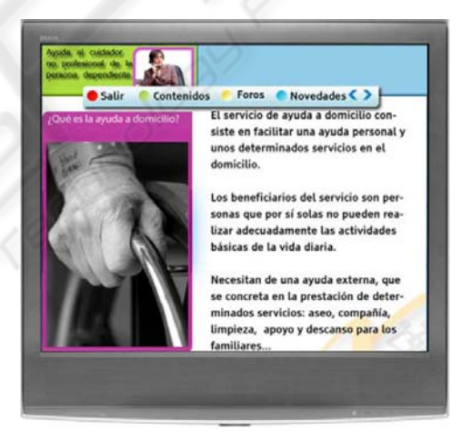
Figure 4: DTT environment.