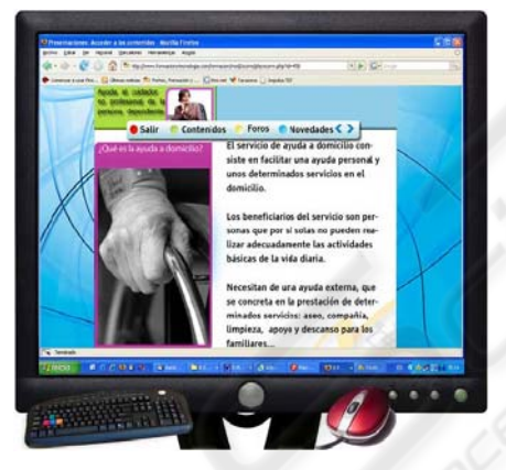
Figure 2: Internet environment.

There are partial evaluations which are not modifiable, that is, it is recommended to include an evaluation test after each module or unit, which can be answered only once. To complete the test, each participant will interact with the application, according to the interaction modalities of the chosen technology (Internet, DTT, mobile), marking the alternative, among the proposed ones, that he/she might consider to be the right one.