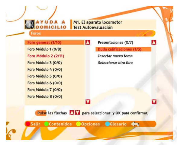
Figure 6: User interaction in DTT environment.