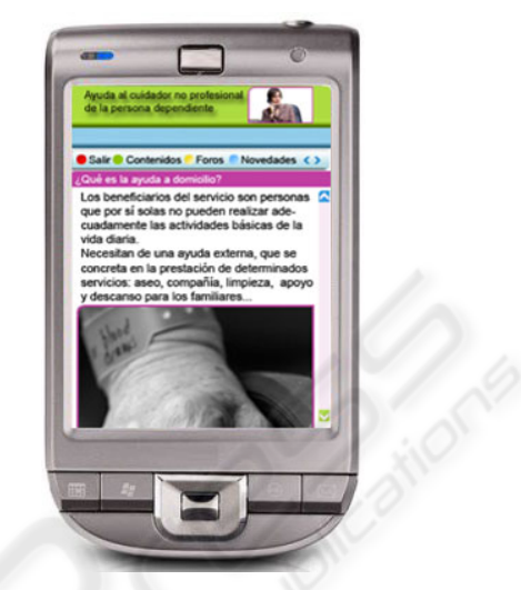
Figure 3: Mobile devices environment.

either through the traditional alphanumeric keyboard or through virtual keyboard or the numeric keyboard.