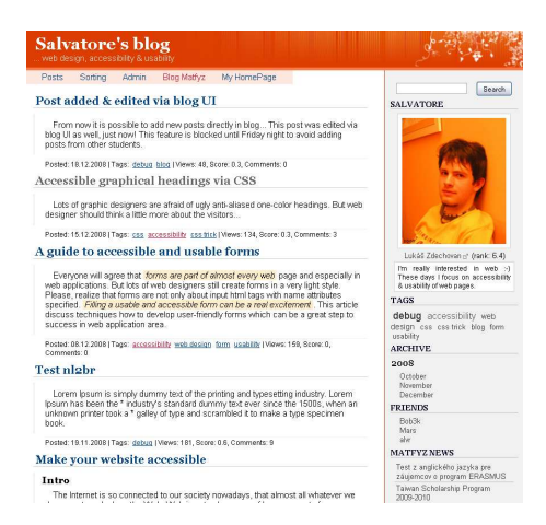
Figure 3: Custom blog layout by a student of the course.

awarded some extra evaluation points for doing that. Every year some of the most active and creative students come up with entirely original ideas to implement on their blogs thus exploring blogs as a web design genre and publication media to the fullest. Another part of the blog which is evaluated is its compliance to the web design quality standards such as code validity, cross browser compatibility, accessibility and usability. It is not trivial at all to produce web applications that are both compliant with the quality standards and still neatly and attractively designed. What is more, this fact is still frequently ignored even by professional web developers; appealing design and cool user interface features are commonly preferred to accessibility and ease of use (Nielsen, 2008).