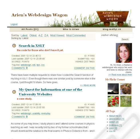
Figure 4: Another student's custom blog layout.

The course has already run three times in the form described in this paper. In Table 1 we provide some statistical data from each run of the course. Even if each student could get around by posting 3–4 articles, we can see that the average number of articles is higher than that. Also, the number of comments significantly outnumbers the number of articles, and we notice unusually high number of comments for the second year even if the number of participating students was low on that year. Indeed students' activity varies for each group but overall we conclude that students' involve-