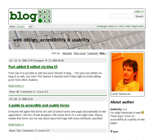
Figure 1: Typical blog within our portal in default layout.

Educational goal. To provide a supportive environment for various courses taught at the faculty, most notably our course.