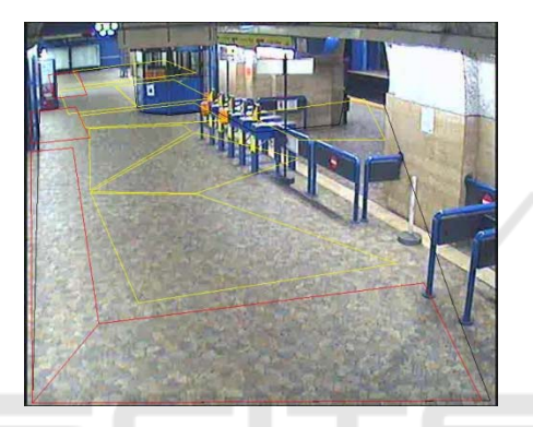
Figure 4: The yellow polygons show the outline of the learned lost zones. The red polygons show the outline of the entry zone, exit zone and IO zones.

A zone triplet is a set of 5 values (start Tzone, lost Tzone, found Tzone, minimum time, maximum time). "Start Tzone" is entry or IO zone where trajectories begin. "Lost Tzone" is the first lost zone or the first lost-found zone where the complete trajectories pass. "Found Tzone" is the first found zone or lost-found zone where the complete trajectories pass just after passing a lost Tzone. Found zone has to be searched only after the object has left its lost Tzone. Minimum time is calculated by the difference between the instant when entering the found Tzone and the instant when exiting the lost Tzone. Maximum time is calculated by the difference between the instant when leaving the found Tzone and the instant when entering the lost Tzone.