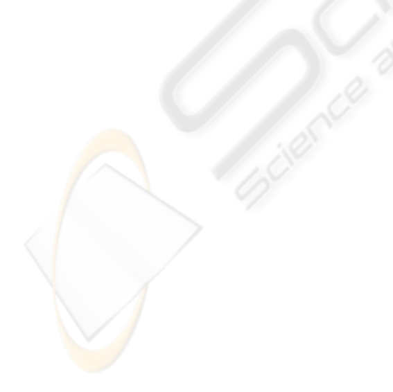
Figure 2: E-learning environment data architecture.

Our goal is to capture the real intentions of each user navigating through the e-learning environment, but focusing on those activities related to the learning process (accessing the mailbox and virtual classrooms, using learning resources, and so). From the starting page, a set of marks is introduced in the most likely paths followed by the learners, in order to validate such paths and trying to discover any interesting fact that might be relevant.