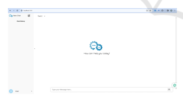
Figure 5: Starting page of Tool 2.

Tool 2 has an avatar, designed by the first author, that resembles two bubble messages with a mechanical appearance and a robotic-style font, Space Grotesk , as shown in Fig. 5. The selection of the avatar and font underwent three iterations, incorporating feedback from two other master's students who were not involved in the experiment.