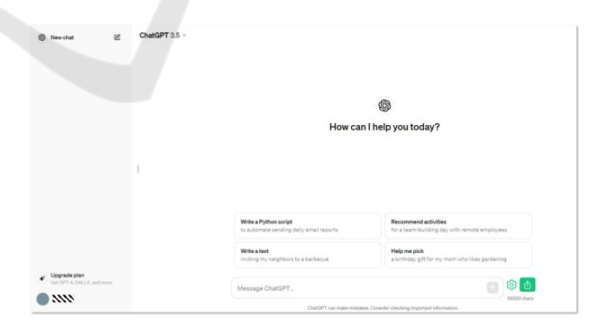
Figure 2: Starting page of ChatGPT 3.5.

To address the research question, we designed three UIs similar in construct to ChatGPT 3.5, which UI is shown in Fig. 2, with variations in avatar and font while sharing the same color scheme.