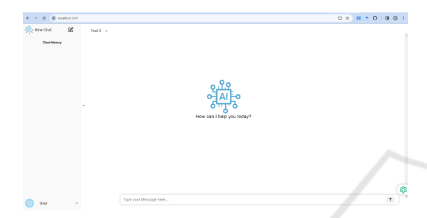
Figure 4: Starting page of Tool 3.

Tool 2 has an avatar, designed by the first author, that resembles two bubble messages with a mechanical appearance and a robotic-style font, Space Grotesk , as shown in Fig. 5. The selection of the avatar and font underwent three iterations, incorporating feedback from two other master's students who were not involved in the experiment.