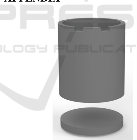
Figure S1: CAD of the 3D-printed material slide (bottom) (9x1 mm) and cylinder (top) (9x15 mm) for the investigation of the endothelial cell adhesion.