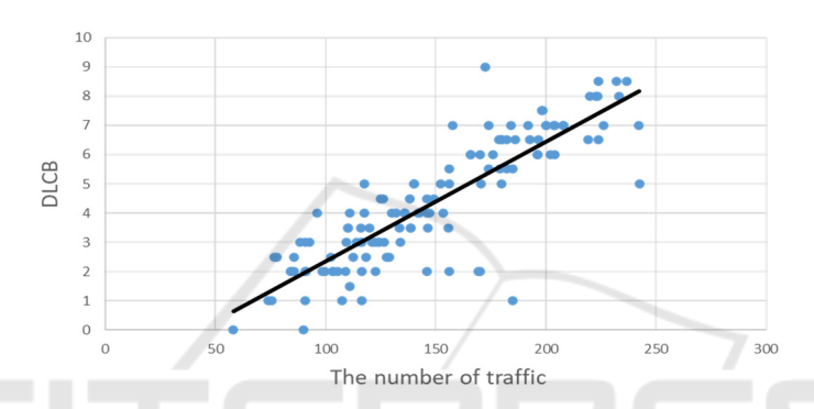
Figure 3: Scatterplot of the number of traffic and DLCB (Original).

Linear regression is a simple method of regression analysis that explores the linear relationship between two variables. Multiple linear regression is an extension of linear regression that explores the linear relationship between multiple independent variables and one dependent variable (Zhang 2022). The principle is to estimate the regression coefficient by minimizing the sum of squares of the residuals, so that the residuals between the predicted and observed values are minimized. It can help to understand the relationship between variables and can help us determine the effect of different independent variables on the dependent variable, and in turn, determine the most relevant independent variables (Jiang 2022). At the same time, it provides a hypothesis test on whether the regression coefficient is significant to help evaluate the statistical significance of the model. Therefore, it is appropriate to choose multiple linear regression in this paper.