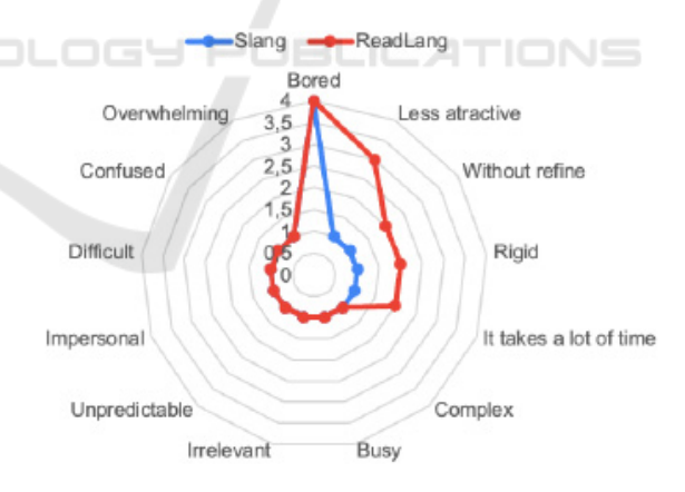
Figure 3: Negative adjectives used to qualify both apps.