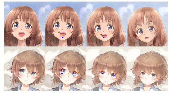
Figure 2: Result of drag.

Compared to diffusion models, GAN-based models offer more precise control over details, which is a notable advantage. This enables the model to finely manipulate and generate stylized images, further enhancing the capabilities of image editing techniques. The marriage of the GAN-based approach with the DragGAN method opens up new possibilities in the realm of anime character customization and facilitates the exploration of diverse artistic expressions.