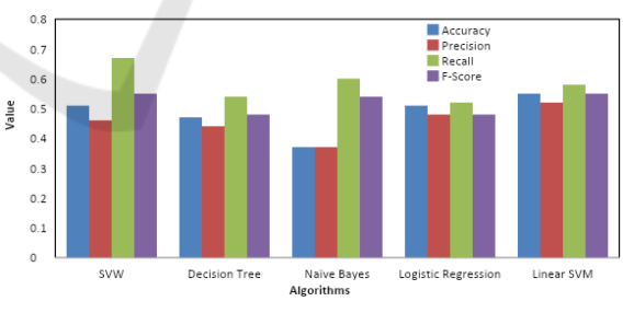
Figure 2: Performance of the Conventional Machine Learning classifiers using Context-Dependent Lexical Features on the Tweet Dataset after Word Embeddings.

Linear SVM had the highest accuracy, with an Fmeasure is of 65 percent. The context-dependent characteristics did not function well, as the data demonstrate. The most essential features in identifying tweets, according to the feature importance study, are location, time, and place.