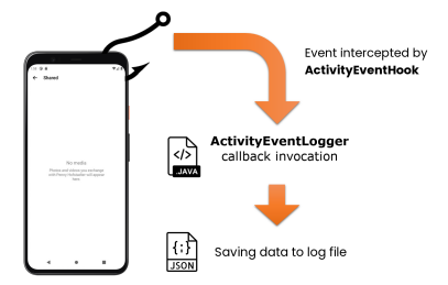
Figure 1: Process of logging an event related to an Activity.

To specify behaviors for a particular group of Activity or View, respectively, filtered according to their class, we defined two abstract