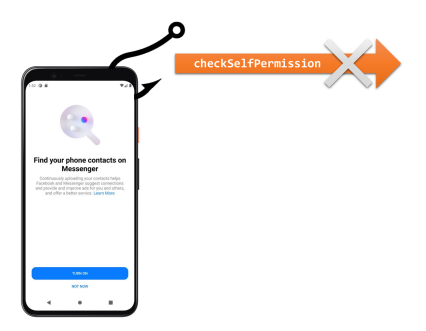
Figure 4: Checks made through checkSelfPermission are ignored to reduce false positives.

For this reason, the entire logging process is delegated to a particular Broadcast Receiver<sup>7</sup>, PermissionCheckLogger, which is automatically injected and registered by RPCDroid when a monitored application is launched, and the callback merely send it an Intent<sup>8</sup> containing all the information about the intercepted request (such as the permission name and the timestamp ).