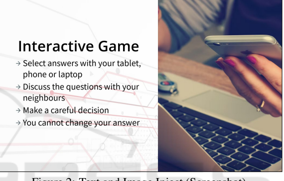
Figure 2: Text and Image Inject (Screenshot).

For the implementation of the scenario, we created one presentation deck and then added several slides. Each slide is then filled with text, images or polls depending on the scenario design. For example in Figure 2, we outline a text and image inject that introduces the exercise.