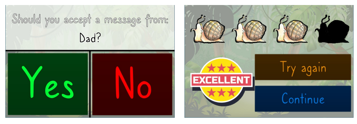
Figure 3: Quiz question screen (left) and results (right).