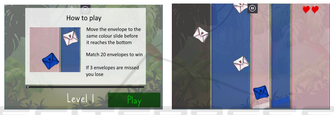
Figure 4: Safety Snail's e-mail game menu screen (left) and game (right) .