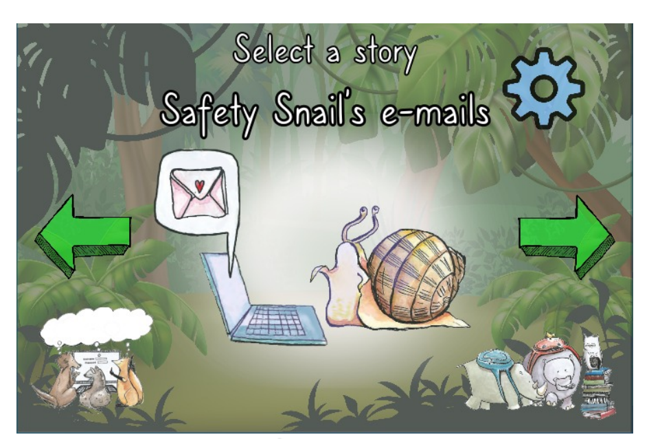
Figure 1: Application main menu.