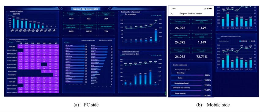
Figure 3: Customized tablet.

and department-based statistical data of all required checks in the whole area, as shown in Figure 3 (b) below. The performance assessment of the work required to be inspected is carried out, and the completion rate of the work required to be inspected is implemented in all departments. It can be seen that the overall completion rate of the work required to be inspected is completed in the whole district, as well as the work completion rate of each leading department. Accurate statistics of work.