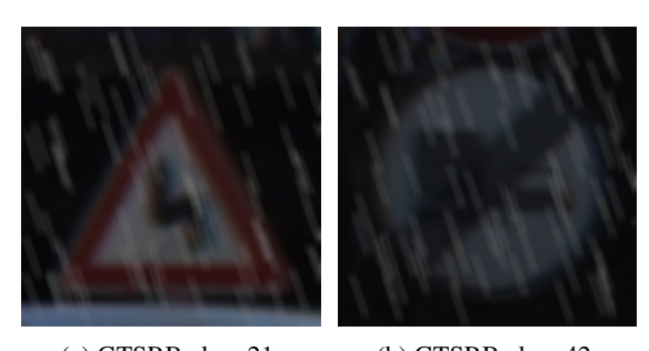
(a) GTSRB class 21.(b) GTSRB class 42.Figure 1: Examples of the heavy rain transformation.

not trained on) containing data samples of all classes in heavy rain conditions is evaluated by the model. It is possible to use data samples captured in heavy rain conditions or transform data samples from clear weather conditions with a heavy rain simulation. If the accuracy of this evaluation is greater than 90%, the requirement is fulfilled.