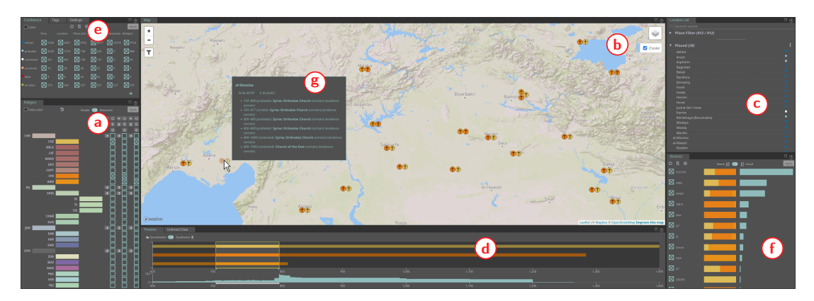
Figure 1: The visual analysis component of Damast consists of multiple, resizable and rearrangeable, coordinated views. Visible here are the (a) religion view, (b) map view, (c) location list, (d) timeline, (e) confidence, and (f) sources view. The tags and undated data views, as well as the settings pane, are stacked behind visible views and can be accessed on demand. More information about the data represented under the mouse cursor is shown in (g) tooltips. A step of the example analysis from Section 6.1 is shown: The advanced religion filter permits only evidence from places where at least two of the three religious groups Church of the East, Syriac-Orthodox Church , and Armenian Church are present. The timeline filter limits evidence to that present in the 8<sup>th</sup> century.