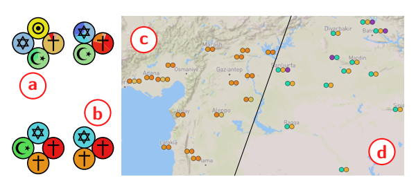
Figure 2: The map glyph design for the aggregation level of religious groups (a) and for a smaller subset of data with lower aggregation (b). The unclustered mode of the map (c and d) uses smaller glyphs and is appropriate for analyses of smaller subsets of the data, such as with the three groups shown here. A false-color mode (d) can be used for color-coding instead of using the colors stored in the database.

The map view (Fig. 1b) shows the geospatial aspect of the data. It takes a central place in the visualization to support the map-based working method of the historians. We decided aggregation would be necessary, but iterated over the strength and strategy of aggregation multiple times to ensure truthful, non-misleading representation ( R6 ). The final design consists of complex glyphs representing clusters of cities in the map, where the clusters are constructed in a way that ensures glyphs will not overlap. These represent the religious groups in up to four pie charts (Figs. 2a