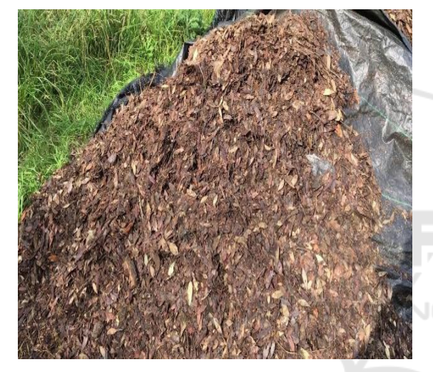
Figure 2: Organic Waste.

The source of this activity is the teacher of SMAN 15 Padang with the stages of the waste recycling project, namely the introduction of waste recycling, analyzing the materials needed, and the steps for recycling domestic waste and presentations. Student action is to recycle organic waste into compost. The reflection that is carried out is to see the level of success in the recycling of waste into compost.