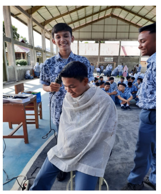
Figure 5: Haircut Project.

The general stage is the introduction of face makeup and haircut, analyzing the tools and materials needed, and stages of making up and haircuts and presentations from students. The action carried out practicing makeup with the model and cutting hair, and reflection is the final result of makeup on the face and haircut.