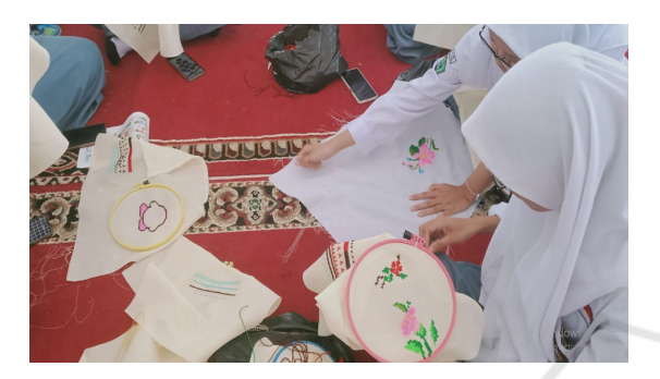
Figure 7: Hand embroidery.

The process stages of this project include the introduction of hand embroidery, the stages of analysis of the materials needed to make hand embroidery, and presentations from each group. The action stages on hand embroidery make strimin wool and knitted strimin embroidery. The reflection is carried out on the final results of the hand embroidery, with the speaker from SMAN 15 Padang teacher.