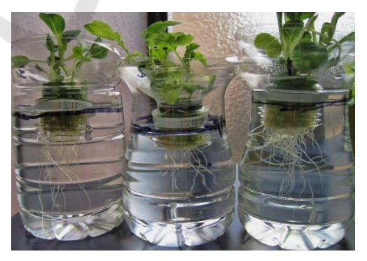
Figure 1: Hydroponics.

In this activity, students realize that the willingness to land in the future will be limited due to population growth. It is a way to maintain a sustainable life for the long term. Furthermore, students also build awareness to behave and behave environmentally friendly, study the potential for the sustainability crisis in the surrounding environment, and develop readiness to deal with and mitigate it.