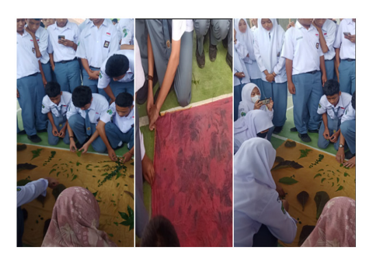
Figure 6: Ecoprint Process.

The process of this eco print project is the introduction stage of eco print, the stages of analysis of the materials needed to make eco print along with their functions and presentations; the action stage is to make an eco print on a piece of white cloth with leaf motifs, flowers, and branches, the reflection carried out is the result end. This eco-print activity is a multidiscipline subject, including biology, art, and culture.