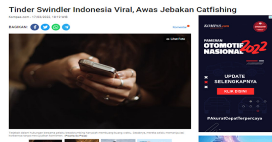
Figure 2: Kompas.com News.

Based on the picture above, it was presented by Twitter user AsbianSabi on March 16, 2022, he posted a video of someone who looks like the perpetrator being chased by a security guard and a man. The post can be seen in the comments session in the thread posted night without a word.