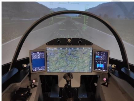
Figure 3: Cockpit simulator with integrated eye-tracking.

The second step of this study was the implementation and evaluation of a cockpit adaption in a representative task setting. For this, we implemented 12 different adaption use cases in our cockpit simulator (see Figure 3). Cockpit adaptations were either a computer-generated text message or an indication on the tactical map.