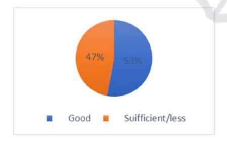
Figure 2: The Proportion of Health Workers' Job Satisfaction in Facing the COVID-19 Pandemic at the Abiansemal District Health Center (n = 83).

Figure 1 and Figure 2 show that most of the respondents, namely 42 respondents (50.6%), had moderate mental workloads. It is also evident that the majority of respondents, namely 44 respondents (53%), had good job satisfaction.