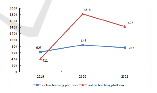
Figure 1 The number of related papers in CNKI from 2019 to 2021

At present, the research of online learning platform has received great attention in China. By using the CNKI to search the relevant literature, the results are shown in Figure 1. It can be found that after the COVID-19 epidemic in 2019, the number of research on online learning platform and online teaching platform increased significantly. Compared with 2020, the number of related articles has decreased in 2021, but on the whole, the research on online learning platform is still the focus of educational circles.