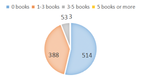
Figure 2. Students interviewed read a map of the number of modern Works of Western literature per semester (Self-drawn)

First, most of the students have heard of or learned about modern Western literary works. As the picture shows (fig 1), 318 students chose "very familiar", 453 students chose "somewhat understanding", and 187 students chose "no know it well". The above situation shows that nearly half of the students have some understanding of modern Western literary works, nearly one-third of the students have a good understanding of modern Western literary works, and less than 20% of the students are not very familiar with modern Western literary works.