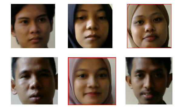
Figure 1: Respondents' faces.