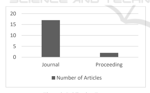
Figure 2: Publication Type.

Figure 1 shows the year of the articles which we analysed have been published. The highest publication period is in 2020, followed by 2019.