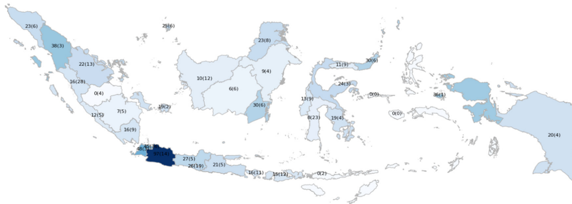
Figure 2: Popularity index ( P_i ) of Indonesian Local Government Mobile Apps per province. West Java has the Mobile Apps with the most popular in Indonesia with 97 point obtained from 14 Apps. The data present in x(y) format where x represent P_i and y represent the number of apps per province.