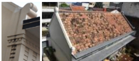
Figure 5: The current roofing and gable wall condition, the 2 ends of gable sloping, finished with curls.

On renovated gable walls Mr. Lin restored the specific design at the peak and at two sloping sides with curls ends as previous. Those styles are not copied from any typical Chinese traditional style. But in general, those decorated parts and sloping ridge at two ends are in general similar to South China's traditional architecture styles. It is a reinterpretation of traditional customs by previous developer.