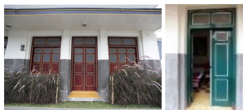
Figure 16: doors' color.

Chinese people really like the color red or vermilion, because it symbolizes luck and joy, they use it a lot on Chinese New Year or special occasions. Many ancient royal buildings used this color. For the facade of Mr. Lin's house, he used red (maroon) with yellow stripes, but not because it symbolizes