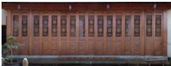
Figure 9: Set of 18 wooden lattice panels at the hall building.