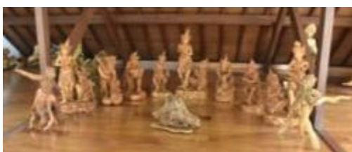
Figure 15: Balinese wooden sculptures collection.

Inside the building number 4, there is plenty of amazing Balinese sculpture collections, especially those created from naturally unique bending wooden trunks. There are some Chinese styles of antique furniture such as an old cabinet and a traditional Chinese canopy bed which were imported from China. The other furniture collections are from mixed styles: modern, Yankees, and antique European style (chairs, writing cabinet).