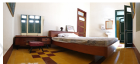
Figure 17: Back side doors' color.

luck. According to him, he is copying the color of his daughter's "The Nanyang Primary School" in Singapore. For him, school (Nanyang Primary School) as the first place people (his daughter) study Chinese culture and Chinese language. He uses this color to remind him that people have to dig their own root. The original color was green Tosca (see bedroom photo).