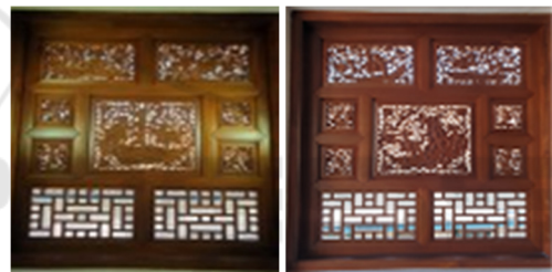
Figure 12: Ventilation openings with hand crafted wooden trellis, decorated with The Three Kingdoms episodes.