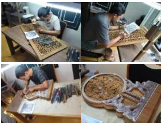
Figure 14: Crafter artisans.