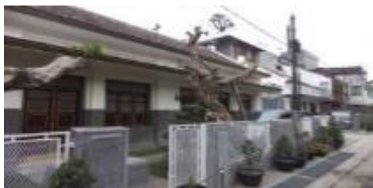
Figure 3: Façade (Basalamah 4, 6, 8) as seen to the east, junction with Jalan Kasmin.