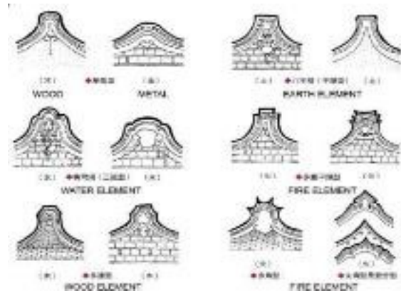
Figure 6: The typical Chinese traditional gable wall peak details.