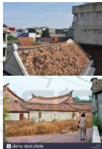
Figure 7: The ending roof ridge is sloping up at both ends, similar with traditional Southern China typical ridge architecture. Here the sloping is with corner and straight line, while the traditional style is smooth arc without any sharp bent.