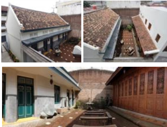
Figure 4: Courtyard.

The courtyard has some benches, sometimes the owner runs movies on the white screen, which covers the red bricks end wall for the shows, and sometimes he likes to have tea in this area. The front building (left side) is still preserved as built before. The right side building is totally rebuilt with new construction; the designer was the late Ir. Ahmad Djuhara. The roof ending has a different style compared with the front side (diverge with traditional custom).