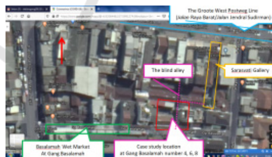
Figure 1: Map of Gang Basalamah.

This paper tries to discuss a well preserved house located in Gang Basalamah (Basalamah Alley) Bandung city, at a business block area (Astana Anyar – Jendral Sudirman). Gang Basalamah is a narrow street of 2 meters in width. Along the western street entrance; nearly half of the street length, with hawker stalls on both sides becoming a traditional wet market called Pasar Basalamah (Basalamah Market). They are selling specifically Chinese dishes' materials (pork, fishes, frogs, crabs, chicken, beef, and Chinese vegetables), condiments, and Chinese spices. On the east side of the road is a clear street without any stalls on both sides are residential areas. The nominated house is a consolidated lot of 3 houses, Gang Basalamah number 4, 6, and 8.