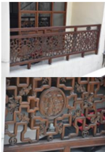
Figure 10: The railing with Chinese style lattices pattern, medallion with The Gods ( Fu Lu Shou 福禄寿) images.

Some wooden crafted ornament units on the wall as ventilation openings (crafted with “The three kingdoms” episodes), at the balcony railings they show intricate Chinese traditional patterns, some railing with Chinese object crafted emblem with figures of The Gods ( Fu Lu Shou 福禄寿).