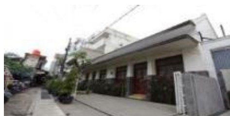
Figure 2: Building (Basalamah 6, 8) façade as seen to the west, the end side of the traditional wet market.