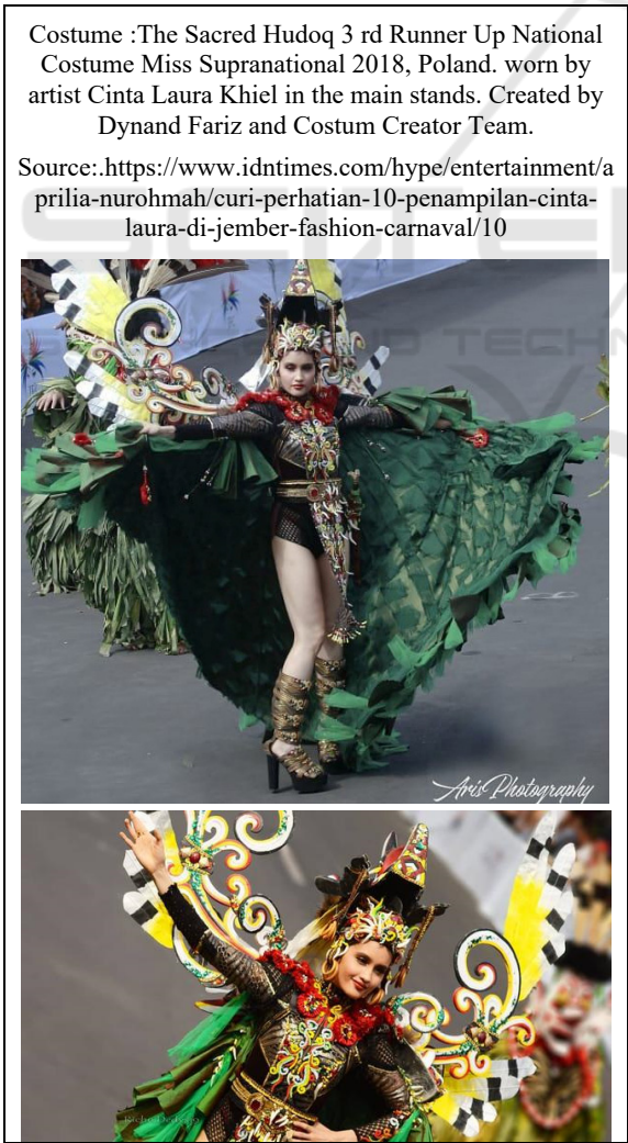
Table 2: Costume Code Analysis: The Sacred Hudoq.