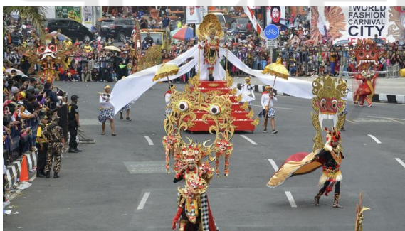
Figure 3: Complex crosses code invite enthusiastic appreciators. Participants are creators, choreographers as well as theatrical dancers.

Hybridity code is understood as crossover code applied to costumes beyond the commonly code used in fashion. An unusual and complex mixture, covering various aspects including shape, texture, color, composition, material, technique, ideology and culture. This cross has created visual appeal due to its unique nature.