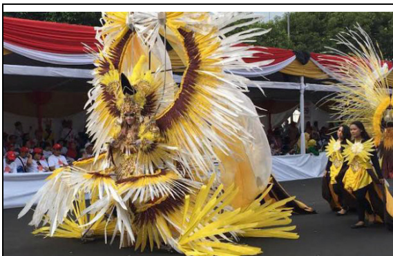
JFC Creator Creations on the Catwalk Runway