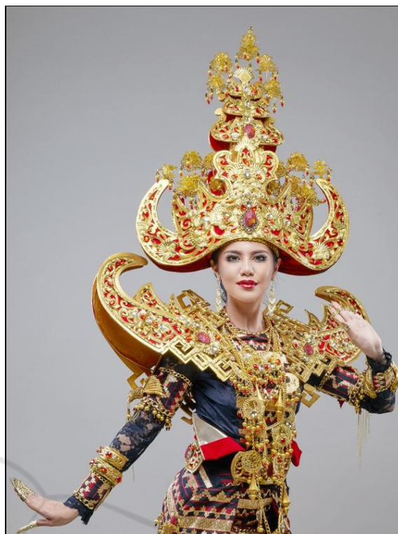
JFC Creator Creations on the Catwalk Runway