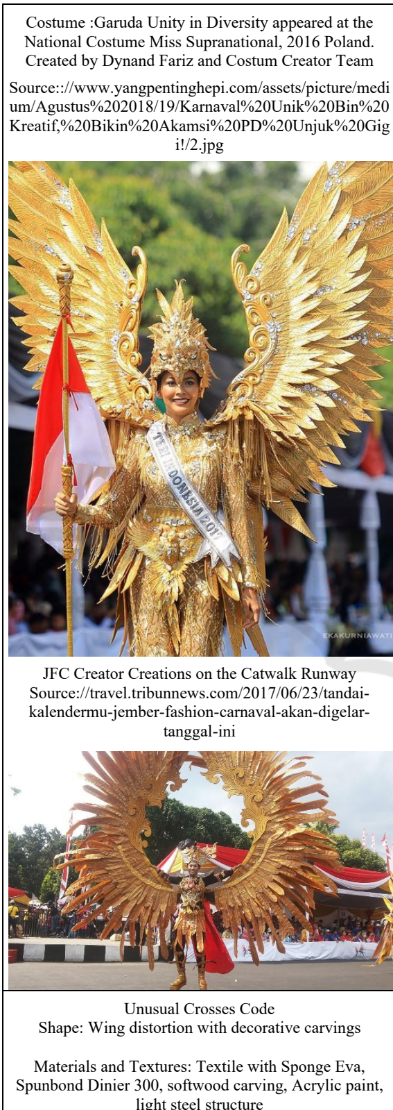
Table 3: Costume Code Analysis: Garuda Unity in Diversity