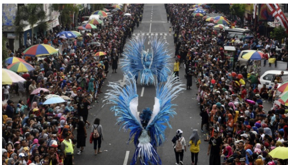
Figure 2: The main street of Jember city ±3.6 km, as the longest carnival runway catwalk in the world.

costumes. The young creators created and demonstrated the costumes themselves and chose city streets as catwalks for doing choreography and dance.