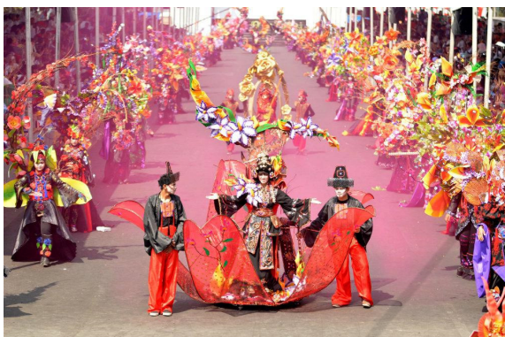
Figure 1: JFC Tribune stage, Sudarman steet, Jember Square.

This is marked by the increasing number of professional photographers, both domestic and transnational, recorded in 2019 reaching \pm 350 photographers outside those who registered. The JFC committee provides a special stage at the end of the catwalk, opposite the main stage. In front of these photographers, the actors perform their best choreography, after giving choreography in front of the audience on the left and right of tribune stage along \pm 200 m.