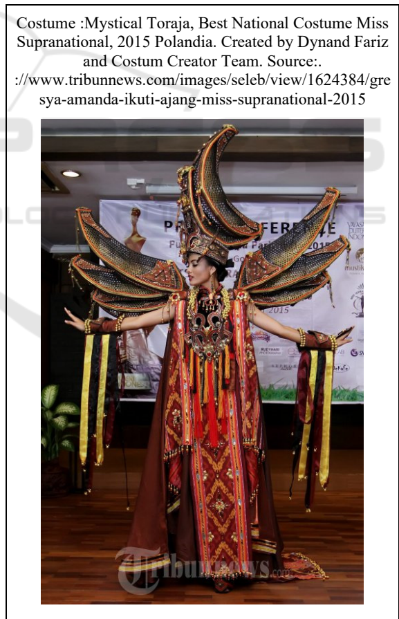
Table 4: Costume Code Analysis: Toraja.