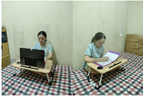
Figure 12: Prototype Ergonomic and Construction Test.