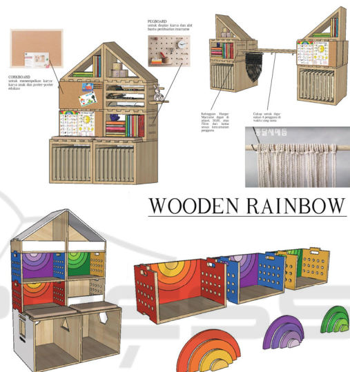
Figure 7: Example of Renders Brought in Discussion.

First FGD carried out by showing design renders in casual discussions while carrying out activities as usual to get an honest opinion on design interest, material selections, activities to cater. After the first FGD, selected design or designs will be developed for another 3 alternatives to be discussed with tutor regarding design, brought to wood and materials laboratorium regarding realisation possibility, and selected 1 to be made the 1:1 mock up.