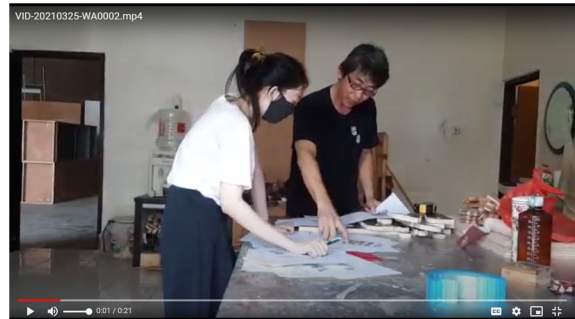
Figure 10: Direct Meeting and Updates Videos.

process (figure 10). Virtual updates were sent by the contractors to the students simultaneously (figure 11). Update on working progress delivered to supervisors virtually.