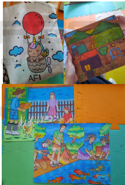
Figure 4: Few Art Activities Done in Rumah Langit.

First meeting on site was done by having an interview with the chairman of the household, Rumah Langit coordinator, PIC from Generasi Peduli for Rumah Langit, and a few residence representatives. The students were expecting to find potentials in residence to be invited for collaboration for their learning house. Unfortunately, adults' responses were lacking, as well as the chairman of the household support was minimal and returned all data requested to be achieved from Rumah Langit coordinator only. However, at this stage, the students found that children in Rumah Langit were very enthusiastic. Apart from academic learning conducted routinely in Rumah Langit, the children also developed very well in art (see figure 4).