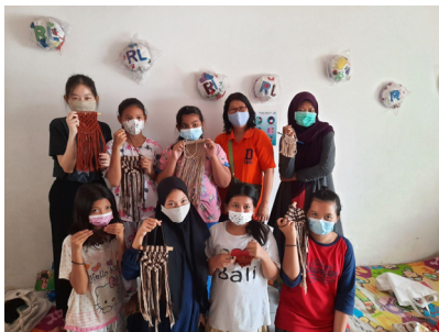
Figure 9: Macrame Making Activity.

At this stage, students did their discussion with the supervisors virtually and visitation to Rumah Langit was lessened. In exchange, they were required to think of the production stage and budgeting that often missed out on the on-campus learning process. Discussion with supervisors mainly to ensure each need were met, schematic design alternatives were well understood, and to give advice on possible realisation to enter prototype stage. Assessment at the ideation stage is proposed to be combined with the prototype stage.