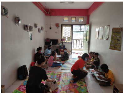
Figure 3: Observation in Rumah Langit.

Initial discussion with management of Rumah Langit and Generasi Peduli was done virtually. Project overview, community profile, and facilities needed were communicated. To gain deeper insight of the occupants needs and the community potentials, direct observation, interviews, and field measurements are still necessary to be done directly.