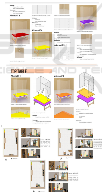
Figure 6: Example of Ideation Stage.

At this stage, ideas are generated as much as possible. There are hundreds of ideation techniques, brainstorming sessions are typically used to stimulate free thinking, out of the box ideas, and to expand the problem space. It is important to get as many ideas or problem solutions as possible at the beginning of the Ideation phase (Dam & Siang, 2021).