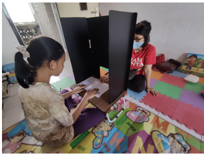
Figure 8: Trial with 1:1 Mockup.