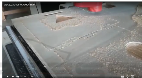
Figure 11: Virtual Updates Through Videos.

The prototype was then tested before it went into the finishing stage and delivered to Rumah Langit to be re-examined, evaluated, and repaired for any minor adjustments before finals (figure 12). After the prototype is coated and finished, designers should test the joints and configuration before shipping it to Rumah Langit for further testing (figure 13).