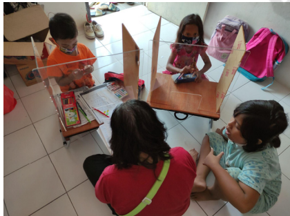
Figure 13: Joint, Finishing, and Configuration Test.

These stages were often skipped in the previous curriculum which then cut students' opportunity to experience the full range of design thinking process. Oftentimes, in the previous curriculum, the final project studio was finished at the prototype stage as technical drawing ready to produce or as far as the first stage prototype due to limitation of time and administrative reasons.