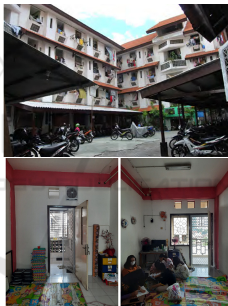
Figure 2: Rumah Langit Situation.

In regards to COVID 19 conditions, the implementation of the threefold missions of higher education, especially community service, has been challenged since it generally requires direct interaction. Virtual learning also becomes a challenge, especially for the pre-prosperous who have limited space, access to knowledge, and access to cyberspace.