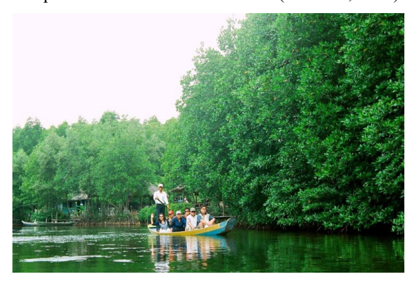
Figure 5: A boat trip along the river.

One of the current important tasks of the city tourism industry is to focus on developing river tourism in the direction of Can Gio, a coastal district with great potential for ecotourism. Located 50 km from the city center by bird-flying with an area of more than 70,000 400 hectares (one third of the whole city), Can Gio has a coastline of more than 20 km and a mangrove area of more than 37,160 hectares (accounting for more than half of the total area of the district). With about 12,000 hectares of natural forest and more than 20,000 hectares of planted forest, Can Gio mangrove ecosystem has recovered and developed well, recognized by UNESCO as the first " mangrove biosphere reserve area" of Vietnam (Lai et al., 2009).