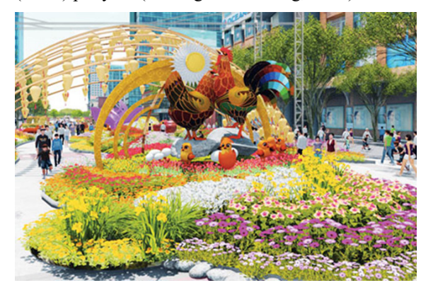
Figure 3: Flower Street Festival in Ho Chi Minh city.

there will be other five-star hotel in this city. As a result, every year, more than three million international visitors come to the city, creating favorable conditions for the industry to achieve revenue of more than 40 trillion Vietnam dong (VND) per year (Phuong and Khuong, 2017).