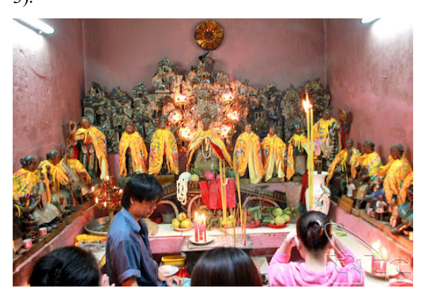
Figure 4: Jade Emperor Pagoda in Ho Chi Minh city.

In order to improve service quality, the city's tourism industry has constantly invested in upgrading and building many new hotels and restaurants. In 2010, Saigon Tourist, a private tourist company, put into use quite new and modern hotels. Some other hotels have been upgraded and expanded (Phuong & Khuong, 2017). Although there are not many monuments and landscapes in Ho Chi Minh City, the tourism industry of the city has sought to exploit its strengths in cultural activities such as festivals, festivals, fairs, especially culinary culture and travel events. Domestic and foreign tourists are quite impressed with travel events such as Nguyen Hue Flower Street, Tourism Festival, Southern Fruit Festival, Southern Land Food Festival, etc. (Figure 3).