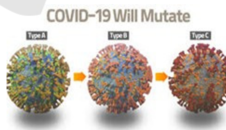
Figure 2: Mutation stages of COVID-19