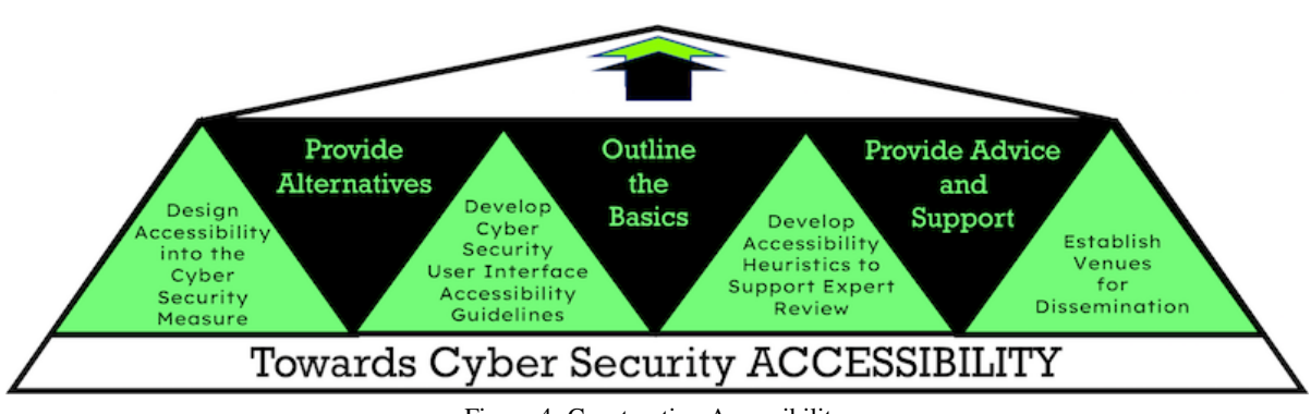
Figure 4: Constructing Accessibility.

ICISSP 2021 - 7th International Conference on Information Systems Security and Privacy