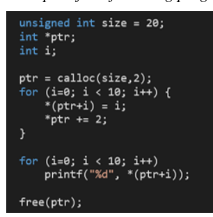
Q2. Correct the syntax errors in the following program segment:

Q1. What is the output of the following program segment?