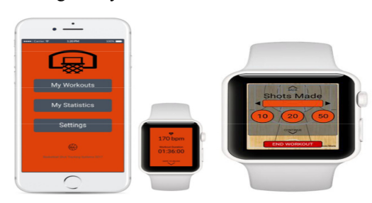
Figure 1: Lifelong m-learning concept: basketball learning application.

learning happens while doing, and here, learning happens in the context of a basketball court. Through the use of contemporary learning tools and media, this can be accomplished without the need to learn a frustrating theory lesson in a classroom.