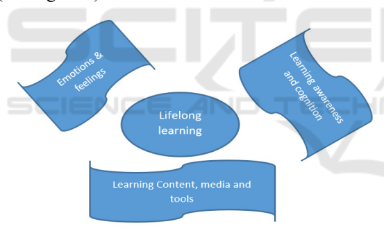
Figure 3. Synthesis of elements contributing to emerging lifelong learning situations.

UX in lifelong learning contributes to a synthesis consisting of situated, emerging learning possibilities that are enabled by pervasive, connected technologies. Furthermore, in learning service development, addressing emotions and feelings complements the compilation of learning materials with learning awareness and cognition, and the learning tools and media. The awareness of the learner's learning profile and strategies (structures for "lifelong learning") enables them to turn emerging situations into learning moments. Positive feelings resulting from a motivating situation and context boost learning outcomes and make it easier for the learner to comprehend and recall the learned content (see Figure 3).