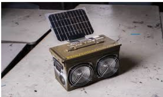
Figure 8: An AMPLIFY speaker kit.

to educate people to become creators, tinkerers and innovators so that they now become the disrupters. Substation33 provides the kit and instructions for people to learn how to build their own speakers for the purpose they desire. The kits and instructions are designed to allow individuals to be as creative as possible. This project desires to bring back the age of handcrafted and bespoke goods and empower as many people as possible to become the creators.