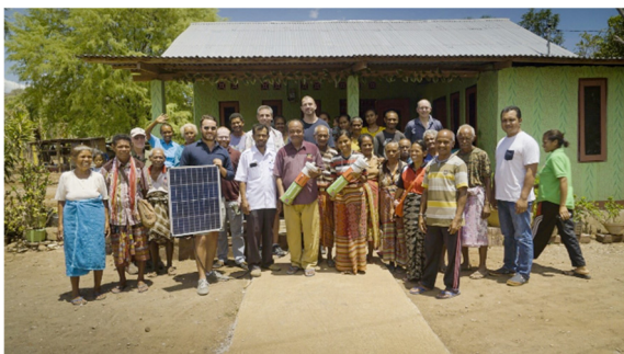
Figure 6: A PowerWell being deployed in a village in South East Asia.

PowerWell's charter is to repurpose recycled laptop batteries and other e-waste componentry to provide a renewable power supply for remote communities. A bank of recycled laptop batteries is configured with a solar panel and power management electronics.