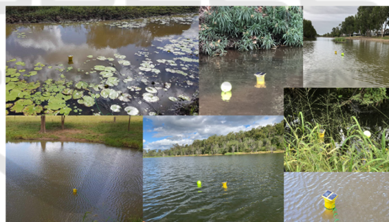
Figure 5: The Smart Buoy remote aquatic environmental monitoring system.

The Smart Buoys project is about developing affordable aquatic environmental monitoring equipment that remotely collects data in near real-time (Trevathan et al. 2012; Trevathan and Johnstone 2018). The traditional approach to water quality monitoring is to travel to the water body and take a one-off manual sample. This sample is then taken back to a laboratory for analysis. However, this approach is expensive, time consuming, slow and is often of limited usefulness.