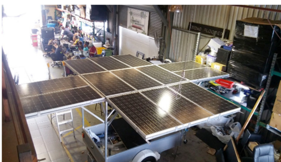
Figure 9: The solar trailer.

Substation33 have developed a mobile solar power battery storage trailer (Figure 9). Equipped with multiple solar panels, the solar trailer is capable of supplying power to over 20 televisions simultaneously. This project has important ramifications in areas that may lack traditional electrical infrastructure (e.g., a rural/remote area or developing country). Furthermore, this product will become more relevant as existing residential solar systems move into obsolescence and discarded solar panels transition to e-waste. In 2019, the solar trailer was used to power several stalls at the Logan Eco Action Festival.