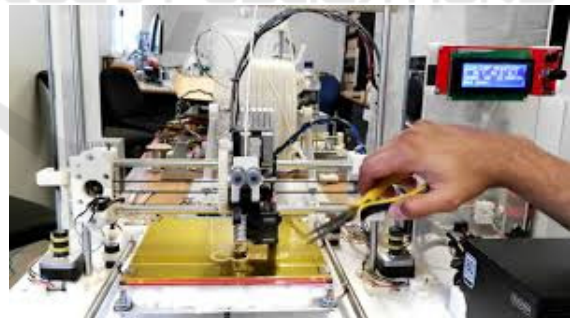
Figure 3: 3D printer assembled from e-waste.

Substation33 can construct 3D printers using up-cycled e-waste for as little as $64 AUD (see Figure 3). Substation33 have built a fleet of over 40 3D printers across Logan City. This provides the ability to mass produce 3D designs for innovation ideas and undertake rapid prototyping for manufacturing purposes. Substation33 works with local schools, educating students on how to construct 3D printers using e-waste and operate them to print innovative