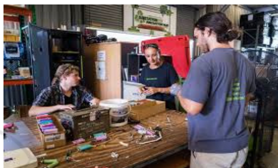
Figure 1: The e-waste disassembly line.

Initially, e-waste is deposited at Substation33's premises. The e-waste undergoes a preliminary audit to determine whether any items are still functional and/or can be used in their present form. These items are stowed, and the remaining items proceed to a sorting phase. Once sorted, the items enter a disassembly line (Figure 1). The items are broken up into their constituent components and all salvageable parts are sorted and stowed. Less than 3% of the disassembled parts become landfill.