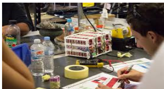
Figure 2: Battery testing and classification.

Laptop batteries are a significant component of e-waste. These components are highly energised and represent a significant danger and pollutant. A laptop