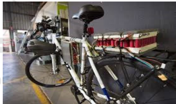
Figure 7: An electric bike.

The electric bike, or e-bike uses recycled laptop batteries and 3D printed battery modules (see Figure 7). A standard bike (often taken from scrap) is converted by adding recycled batteries and a purchased mid-drive motor kit. The battery pack provides over 1kW-hour resulting in a range of around 100km with minimal peddling.