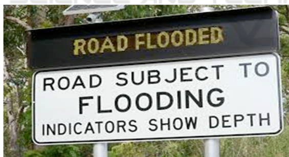
Figure 4: A road flooded safety sign deployed at a road crossing subject to flooding.

A major product Substation33 produces is a solar-powered flooded road traffic sign (Figure 4). In conjunction with the Logan City Council and Griffith University, Substation33 has developed technologies to detect when a creek or river has flooded a road. The road sign is remotely triggered to display a warning to motorists about the flood hazard. Road crews and decision makers can also remotely view roads that are flooding and map this data as a flood event unfolds via a dashboard.