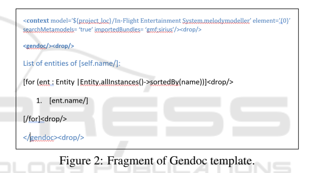
Figure 2 shows an example of template built using Gendoc. It is divided in two parts respectively marked by the context and gendoc tags. The context contains the absolute path to the model, the searchMetamodel and importedBundles information. The gendoc section contains a static text "List of entities", followed by a variable self.name which is the name of the model. A for loop lists inside the model the names of the entities resulting from the AQL request allInstances()->sortedBy(name) ". Figure 3 shows the result generated from this fragment.

Gendoc (Eclipse, 2018) is an Open Source library developed by the Eclipse Foundation under its EPL license. It supports the generation of documents based on EMF models in different formats from Microsoft Office (docx, xslx, pptx) and Libre Office (.odt). Gendoc relies on existing templates for the general structure and styling while the content is specified using XML tags embedding commands for generating rich text, diagrams and tables. It strongly relies on the Acceleo Query Language (AQL), an OCL variant to dynamically retrieve content from the model. It is also compatible with the Papyrus (Eclipse, 2010) and Capella (Polarsys/CIS, 2015) modellers.