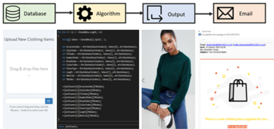
Figure 3: Example of integration test.