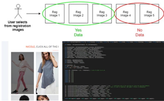
Figure 1: Overview of the training process of the Naive Bayesian Network.

ensure that the user picks at least one clothing item to feed the expert system with. Indeed, the NB algorithm needs yes/no data to be able to calculate a likelihood. Hence, the clothing selected by the user are the ‘Yes’ data, and the remaining clothing items in the training dataset that were not selected are the ‘No’ data.