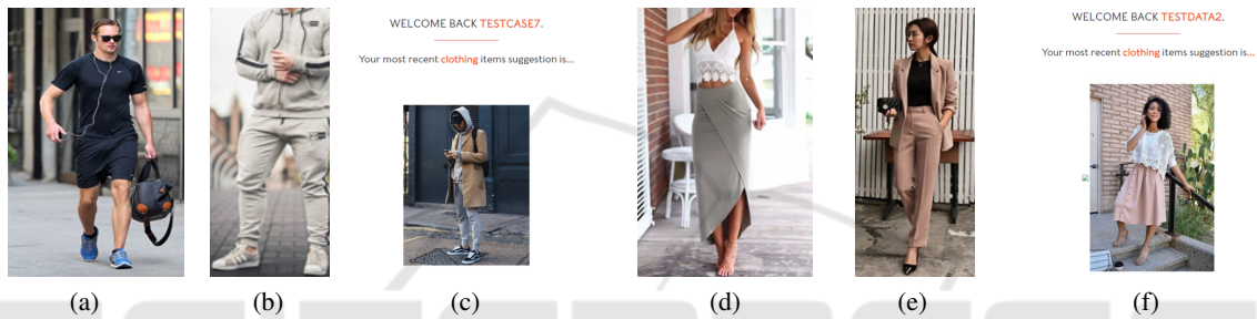
Figure 4: Examples of user testing for menswear and womenswear users, respectively. In particular, pictures (a)-(b) show a sample of a menswear user's given data within his application's account, and picture (c) is a sample of automatically suggested cloth data for the corresponding menswear user, while pictures (d)-(e) display a sample of a womenswear user's given data within her application's account, and picture (f) is a sample of automatically suggested cloth data for the corresponding womenswear user.