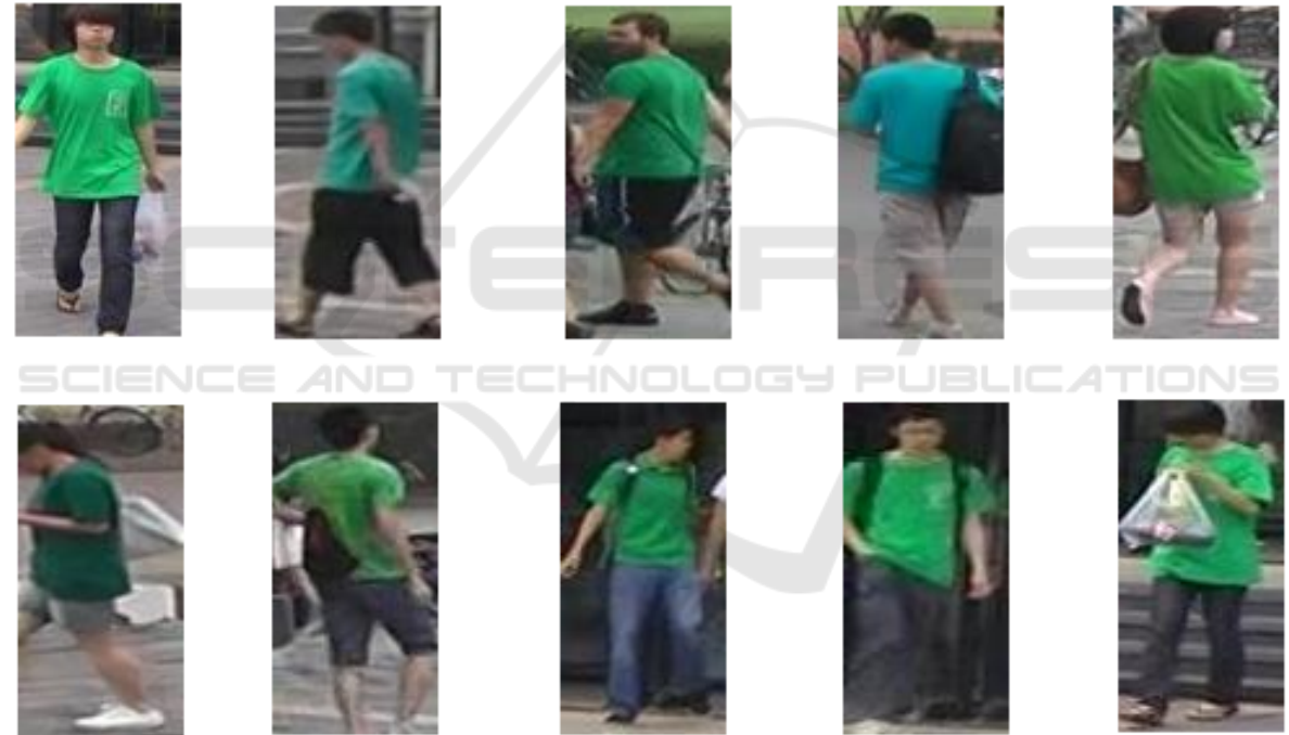
Figure 3: Images from a final cluster when using the pseudo-labels method. The cluster were achieved using Viper as source dataset and Market 1501 as target dataset.

emphasize that our method does not make use of any label from the target domain, completely removing the burden of annotating new data when the application domain changes.