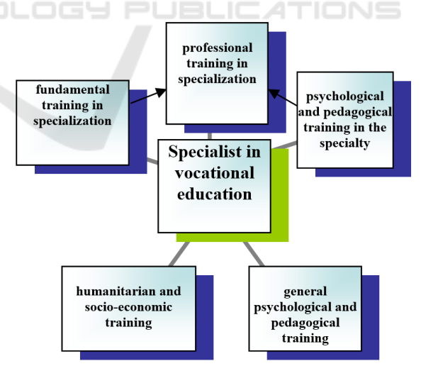
Figure 1: Structural scheme of training future specialists in vocational education.

Taking into account the basic principles of higher education development in Ukraine within the Bologna process, as well as the specifics of professional training, we offer a scheme of educational process based on fundamental and psychological-pedagogical training with a dynamic model of professional disciplines (figure 1).