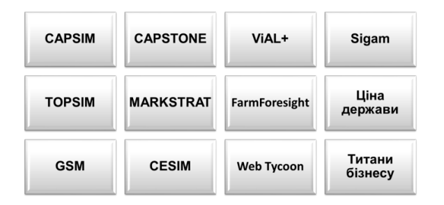
Figure 2: Well-known business simulations in the world and Ukraine.

sured by the application of the method of learning by doing (learning by doing), which gives the participant the opportunity to: