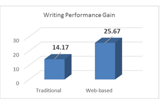
Figure 3. Graph of The Writing Performance Gain of Traditional and Web-Based Writing Assessment.

Even though both the Traditional and the Webbased writing assessment groups gave a significant impact to the students writing performance, the writing performance gain of both groups is different as can be seen in on the very left column of the Table III above. That difference can be more clearly seen in the graph below.