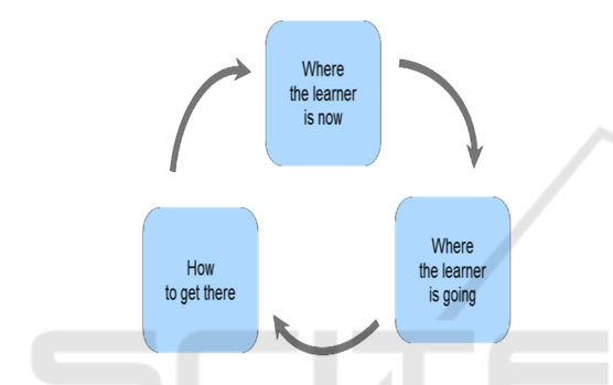
Figure 1. Diagram of The Significance of Feedback in Writing Learning According to The Assessments for Learning (Afl) Theory

what improvements they need to do and how they can do those improvements. Students then will get serious difficulties to revise their writing without having adequate and prompt feedback from their lecturer. Even those that belong to autonomous students still need assistance intervention from their lecturer in revising their writing. The writing complexities that need long turnaround time to assess though often make lecturers get late in giving the feedback. Some lecturers even tend to skip this important step, expecting that the students will just become autonomous by themselves (Edwards, 2012). In some cases, the writing learning process even ended up in the students' submitting their writing assignments since those submitted assignments were never returned to them (Chang, 2007).