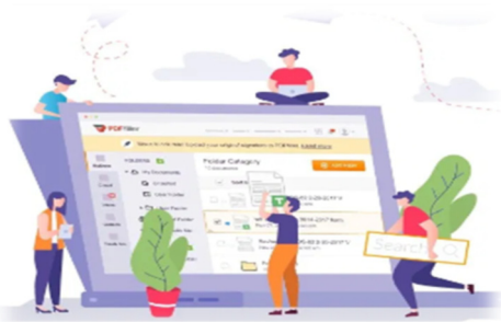
Figure 3: Smart class offers better and increasingly far teaching methods.

Smart Class Can Never Replace a first-hand Teaching Experience. At the same time, a smart class may offer better and increasingly far-reaching methods for educating using innovation; there is no swap for an educator clarifying on the existing ideas through genuine models (Azmiy, N. 2013). Not very cost-effective as it is a general innovation, a smart class is typically a piece on the costlier side. Figure 3 shows the impact of using smart class to enhance student learning outcomes and improve their skills with communication programs. Also, Figure 3 shows the peer-to peer relationships among the students and the use of open source technologies to improve their confidence and achievements.