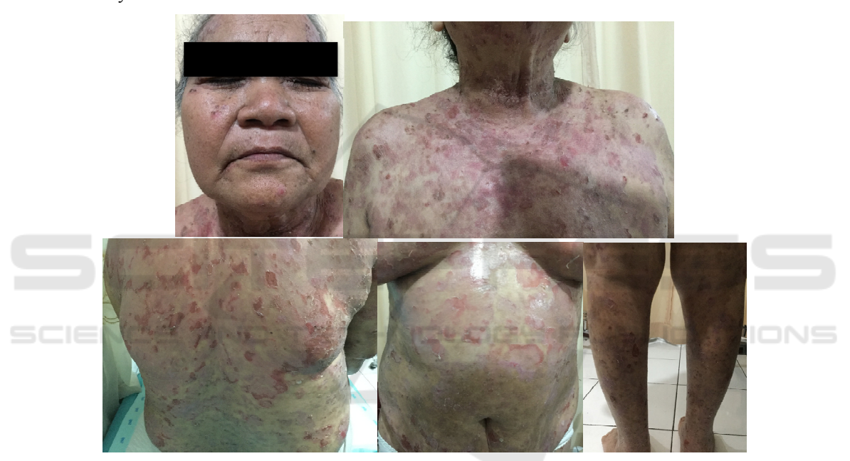
Figure 1. In generalized area, there were multiple bullae and erosions sized lenticular to plaque with erythematous base and hyperpigmented maculae with crust

Physical examination generally was within normal limits. From dermatological examination, we found multiple bullae and erosions sized lenticular to plaque with erythematous base and multiple hyperpigmented maculae with crusts on the face, body and both extremities. We then carried out punch biopsy on patient's bulla for histopathology examination. According to several examination that was done in the patients, we have differential diagnoses of pemphigus vulgaris, pemphigus foliaceus, and bullous pemphigoid. The patient was treated with NaCl 0,9% compress for 15 minutes every 4-6 hours, fusidic acid cream twice a day, 32 mg methylprednisolone every morning, and clarithromycin 500 mg once a day.