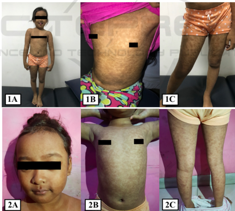
Figure 1: A,B,C. Generalized hyperpigmented macules before treatment. 2A,B,C. After 12 weeks treatment.

Physical examination showed that the patient was in an excellent health condition, has normal general health status, with a weight of 17 kg. The dermatologic examination found erythematous and hyperpigmented macular eruption, with fine scales on the face, neck, trunk, arms and legs. Positive Darier's sign.