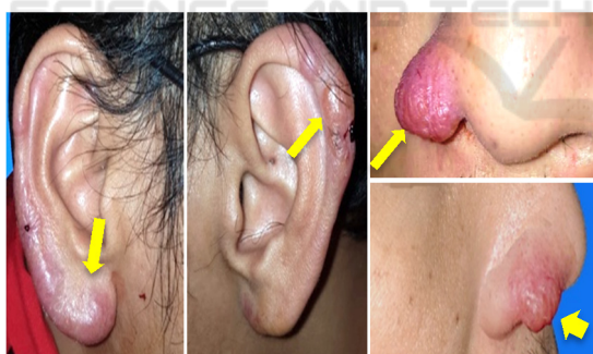
Figure 1. Multiple erythematous plaques were seen on both ear and nose. (Arrows)

Physical examinations showed multiple erythematous plaques with rough scales were seenin both ears. The lesions werevary in size from lenticular to nummular, arranged discreteand some of them was confluent with well demarcated borders. On the nosethere was a solitary nummular circumscribed erythematous plaque with soft consistency. (Figure 1) Dermoscopic examination revealedorange color on skin lesion. Onycodistrophy, onycholysis and digital clubbing were observed on the fourth and first finger of the right foot and the first and fifth finger of the left foot. (Figure 2) On dermoscopic evaluation, there were splinter hemorrhage on the nail bed. Multiple atypical vesselswere found on the fourth nail of the right foot. (Figure 3)