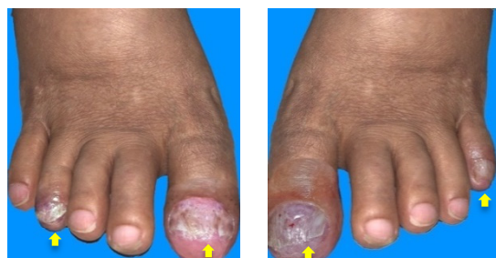
Figure 2. Nail dystrophy and onycholysis. (Arrows)

Based on history taking and physical examination, the differential diagnosis were lupus vulgaris, cutaneous sarcoidosis and cutaneous lymphoma. In order to confirm our diagnosis, the Mycobacterium tuberculosis (MTB), Mycobacterium Other Than Tuberculosis (MOTT) culture and polymerase chain reaction (PCR) obtained from skin tissue was done. The results of MTB and MOTT culture were negative, but PCR was positive for Mycobacterium tuberculosis . Histopathological examination of the nose revealed the epidermis of had flat rete ridges. Epithelioid granuloma was observed in the dermis with multiple giant cells surrounded by sparse lymphocytes infiltrates. Nearby tissue was dominated by inflammatory cells and areas of fibrosis. (Figure 4) On the other hand, histopathological examination of the nail bed revealed acanthotic and irregular elongation of the rete ridges. Epithelioid granuloma was also observed in the dermis of the nailbed and the proximal nail fold under the matrix. (Figure 4) ZiehlNielhsen staining showed no sign of acidfast bacilli on the nose and nail specimen. Chest x-ray examination revealed no sign of sarcoidosis or TB infection in the lung, while x-ray examination on patient's foot showed erosion on distal phalanx of both thumb with osteolytic process on metatarsal and phalanx of first finger, distal tibia and tarsal. No sign of destruction was found.