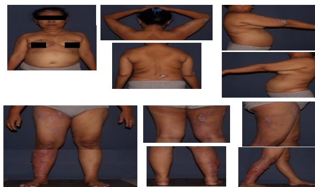
Figure 1. Clinical manifestation in patient