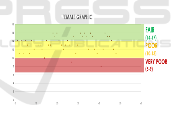
Figure 1: Graphic Result Test of Female Participans

The results showed 2 male candidates (4.08%) and 26 female candidates (54.16%) fell into the category of less. The average physical fitness among candidates Sleman district was in the poor category.